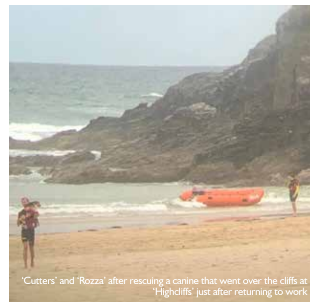
'Cutters' and 'Rozza' after rescuing a canine that went over the cliffs at 'Highcliffs' just after returning to work

Unconscious male, Fallers at Chapel Rock, Cut offs at Flat Rocks, Dog over cliffs, lived and recovered by IRB, Dog over cliffs, not so lucky, Kyacker washed in front of high cliffs and a dramatic