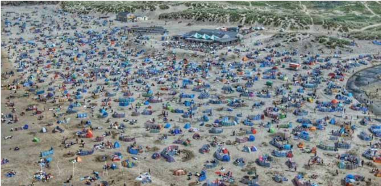
With restricted foreign travel, we had a lot of visitors

This has been a year like no other. The Corona Virus pandemic has had an impact in every sphere of life and the Surf Life Saving Club has not been immune. All aspects of the club membership have been affected except for one, that of the saving of lives from the sea.