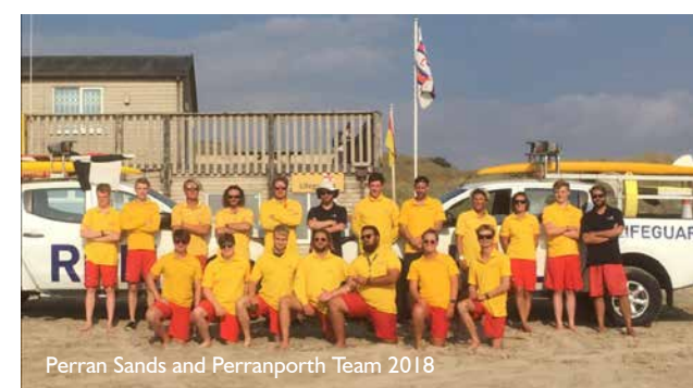
Perran Sands and Perranporth Team 2018