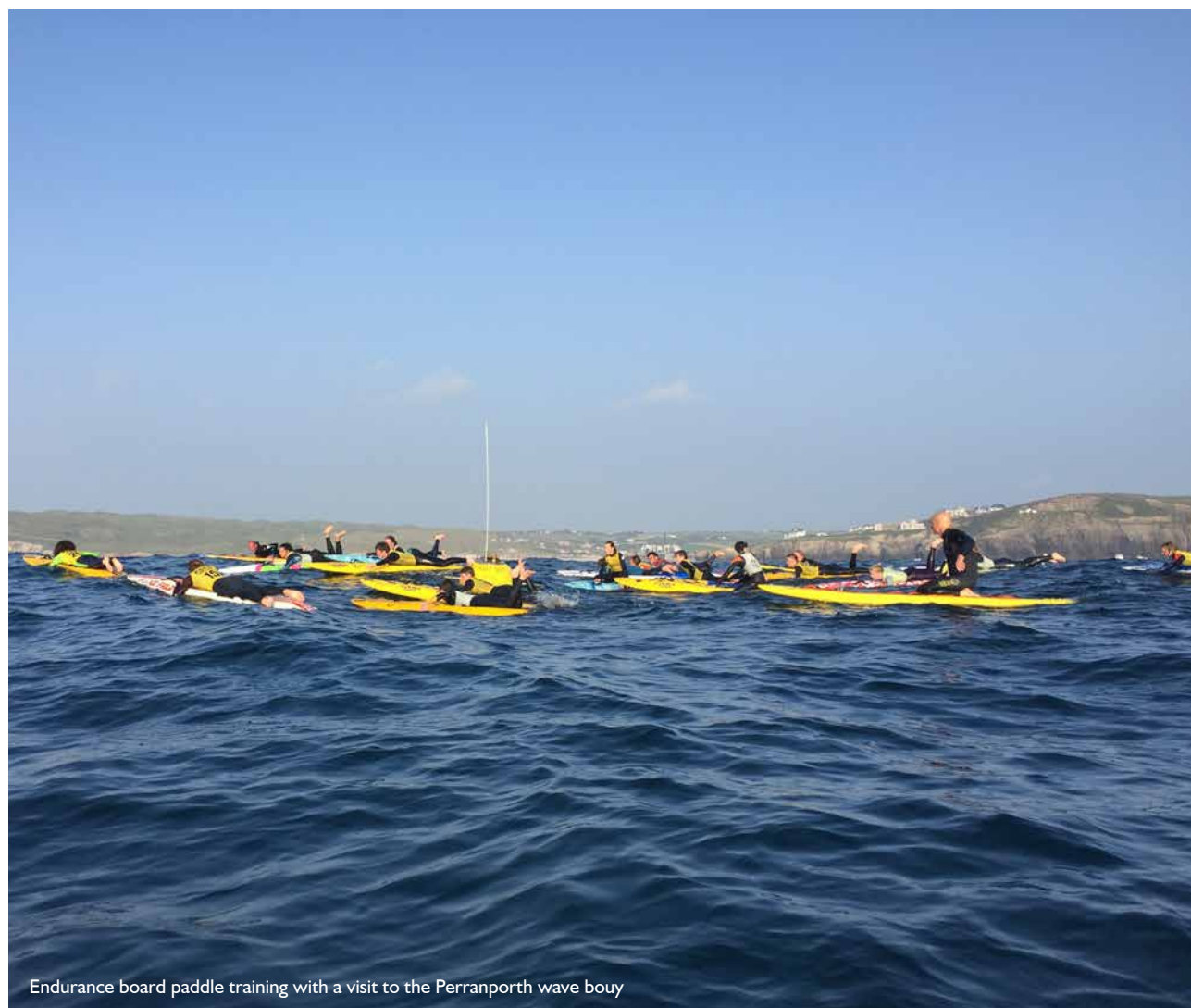
Endurance board paddle training with a visit to the Perranporth wave bouy