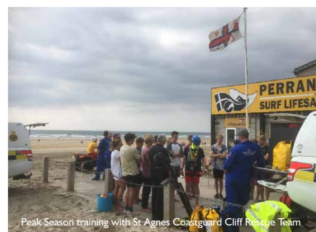
Peak Season training with St Agnes Coastguard Cliff Rescue Team

Perranporth is one of the seven beaches running from Portreath to Holywell managed by the RNLI's Perranporth Support Centre. A lot of our inductions and training for this area are conducted in and around Perranporth due to accessibility, permissions and the size and quality of the beach. Below is a photograph of the Peak Season Induction doing training with St Agnes Cliff Rescue Coastguard Team, seeing their kit, trying on harnesses; all this leads to more integrated inter agency co-operation and smooth running in real situations.