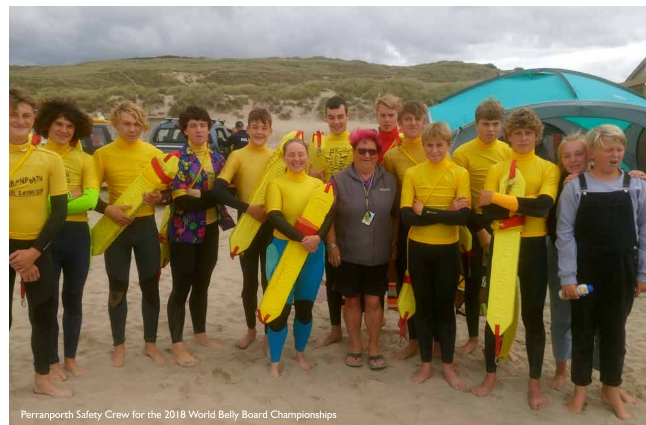
Perranporth Safety Crew for the 2018 World Belly Board Championships