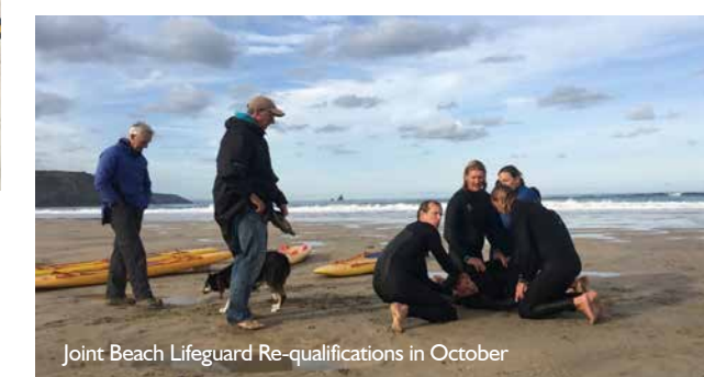
Joint Beach Lifeguard Re-qualifications in October