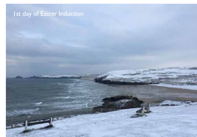
1st day of Easter Induction

As the very white photo shows, 2018 had a cold start to the Spring. Easter was early in 2018 and so was induction, the photo is the actual first day of Induction and that afternoon lifeguards were doing their board competencies and swims in the sea.