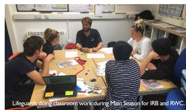
Lifeguards doing classroom work during Main Season for IRB and RWC.

Surf club training, RNLI training and training with other agencies is essential for Lifeguards. This year we had input from wildlife experts, Lifeboat visits, Air Ambulance visit and Police talks to name a few. This gives the lifeguards preparation for any real response. In the first week of Main Season Perranporth lifeguards had to deal with a