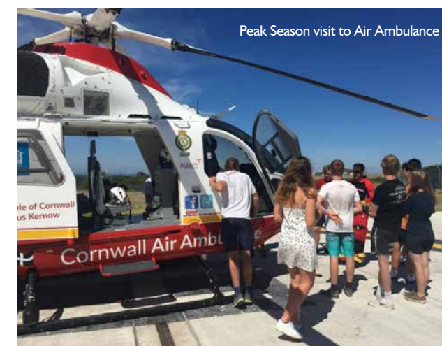
Peak Season visit to Air Ambulance

very nasty double bone break to a member of the public's leg which occurred when hopping the stream. Despite the weather being unfavourable, the Air Ambulance was tasked, first landing at the airfield before their paramedic attended the scene and asked the pilot to go ahead a make a landing on the beach by Ponsmere Cove. This got the season off to the start which continued throughout. We also had some special thanks from the Air Ambulance crew who recognised another lifeguard from her induction visit and wanted to give credit for a life saved in surf.