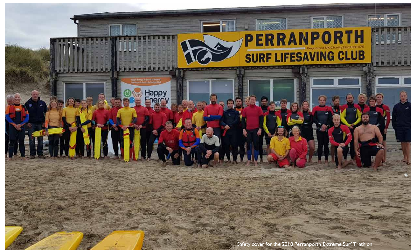
Safety cover for the 2018 Perranporth Extreme Surf Triathlon

One of the most successful events of the year was once again the Triathlon, I felt this September's effort was particularly noteworthy as you can see the strength of the club and how so many of its members work together to make this one of the best Triathlons in the country. Congratulations and thanks are due to all those who made it possible.