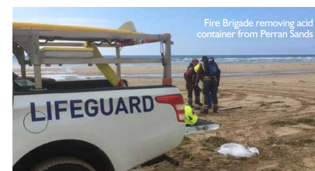
Fire Brigade removing acid container from Perran Sands

In September we had a second occurrence of hazardous substances washing up on the beaches in the area. A