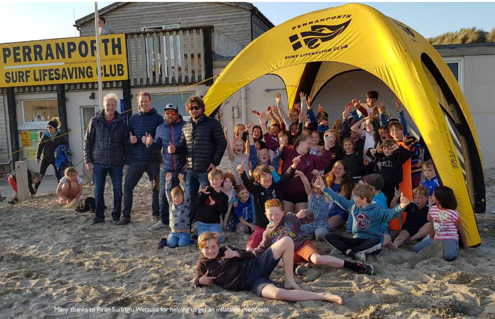
Many thanks to Piran Surf/Iglu Wetsuits for helping us get an inflatable event tent