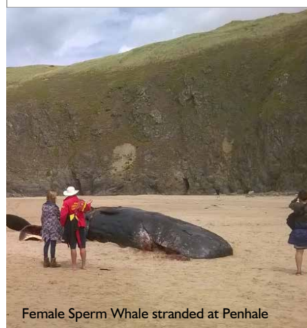
Female Sperm Whale stranded at Penhale