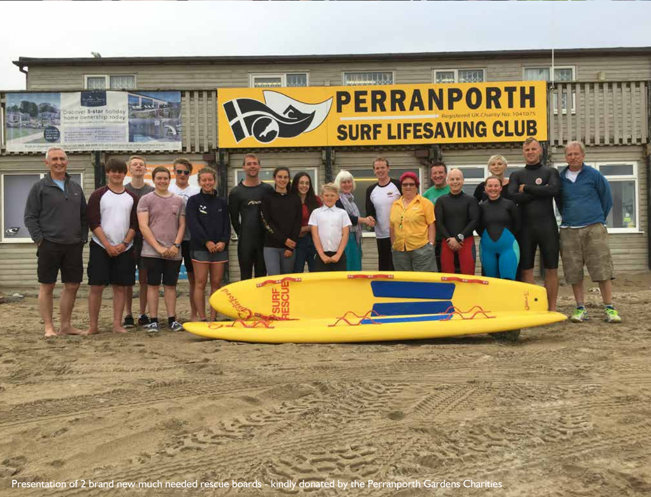
Presentation of 2 brand new much needed rescue boards - kindly donated by the Perranporth Gardens Charities

SKI PADDLER OF THE YEAR (Not presented this year)