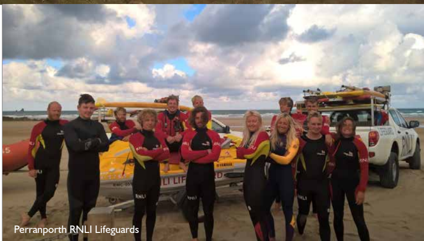
Perranporth RNLI Lifeguards