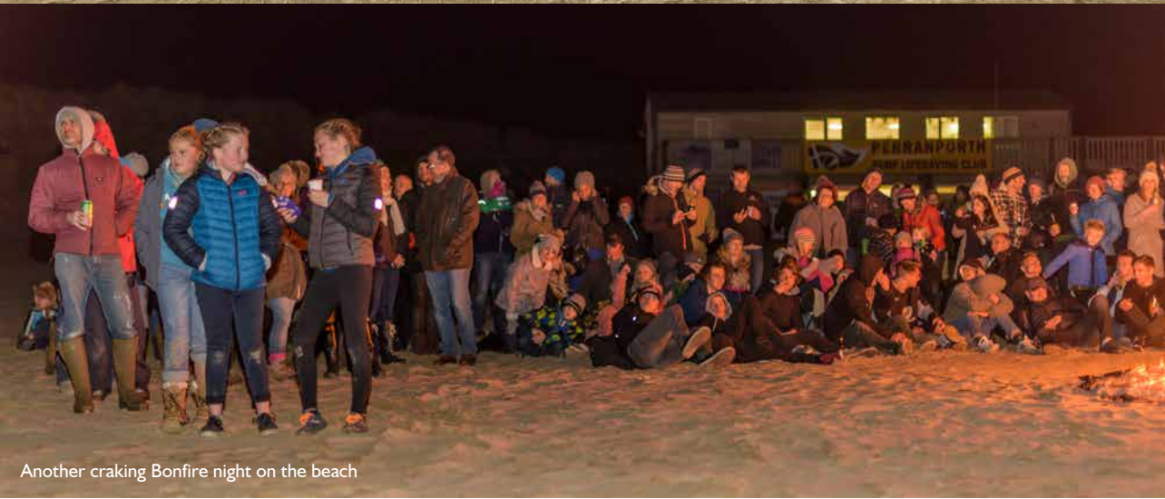
Another craking Bonfire night on the beach